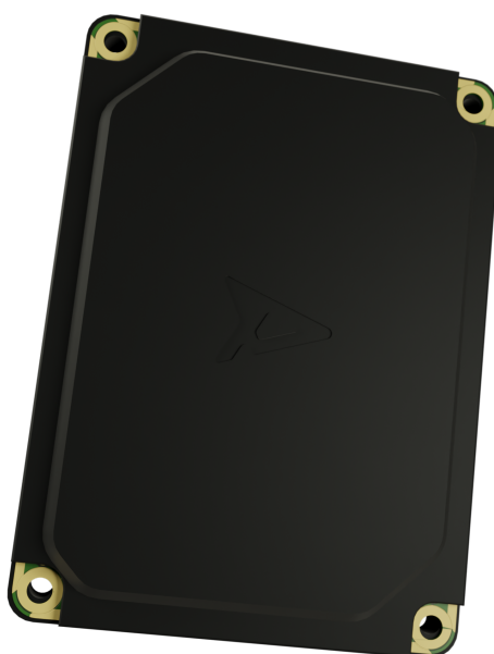
Figure 2: Phantom Forge® encapsulated module (XIPHOS-X3 / XIPHOS-X4).