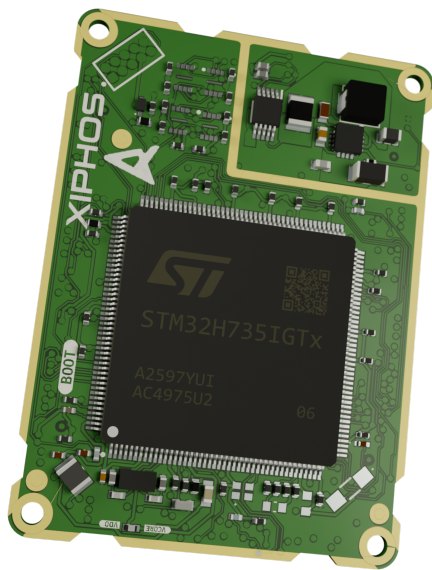
Open-frame (XIPHOS-X1 / XIPHOS-X2)