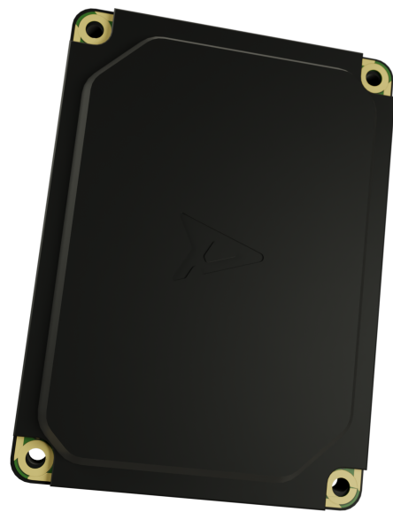
Phantom Forge® encapsulated (XIPHOS-X3 / XIPHOS-X4)

Figure 1: Product variants: open-frame (XIPHOS-X1/XIPHOS-X2) and Phantom Forge® encapsulated (XIPHOS-X3/XIPHOS-X4).